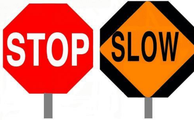
Approved Stop/Slow Paddles