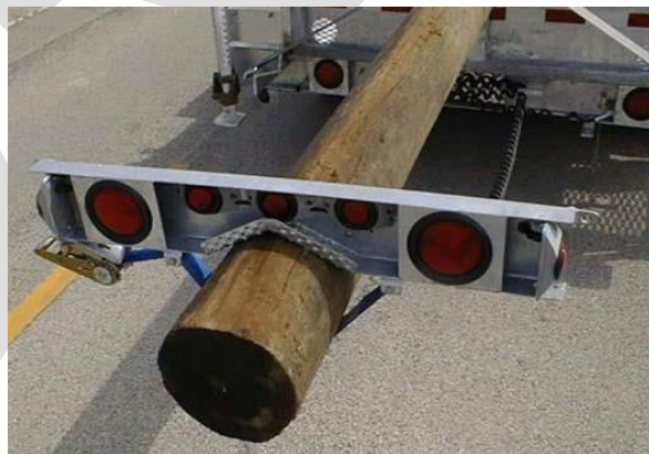
Example of an Extended Light Bar

8.2.2.3 Must have either an extended light bar or a rear pilot/escort vehicle.