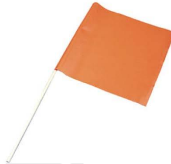
Approved Red Flag Approved Fluorescent Orange Flag